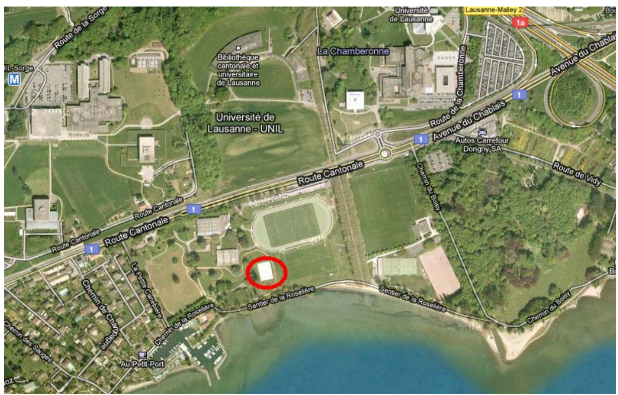
Sport fields University of Lausanne close to the Leman lake