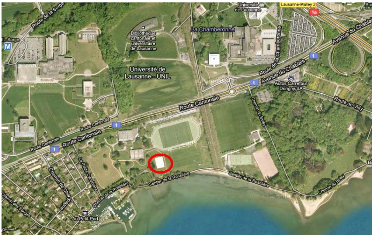
Sport fields University of Lausanne close to the Lemman lake